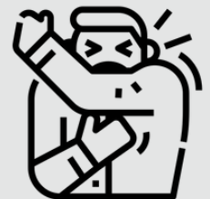
Cover Coughs & Sneezes